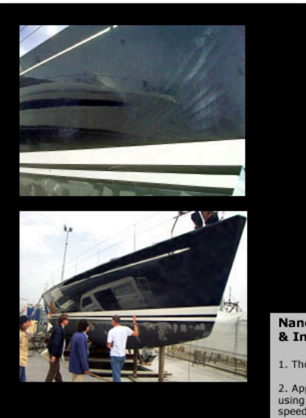
Badly damaged Swan 82 PARADIS undergoing major refit and HOLMENKOL treatment to teak decks, topsides and cabin areas.